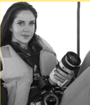
Front Cover: "California Leaping" by Victoria Van Trees, @vantreesphotography