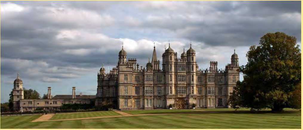
© Country House by Ron Porter