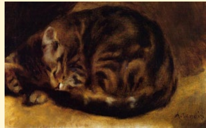
Pierre-Auguste Renoir – Sleeping Cat

Relax and feast on a visual and aural tour of the arts that shaped our lives, beginning with our Summer Lecture Series exploring art through the eyes of our pets— or perhaps pets through the eyes of society — in “Hounded Through History” and “Nine Lives and Catnip.”