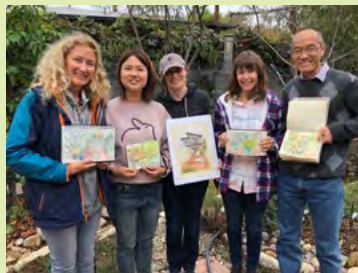
Plein Air Outdoor Watercolor Painting

See pages 4, 6, 10, and 14 for more details.