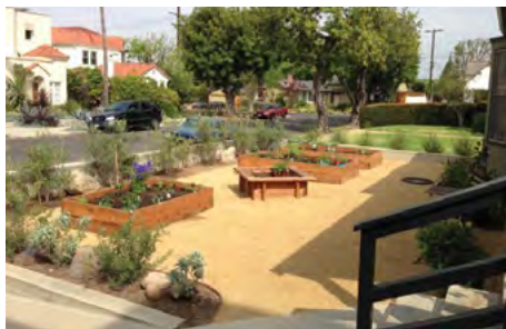
Basic Organic Gardening