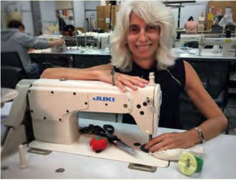
Sewing Machine Bootcamp