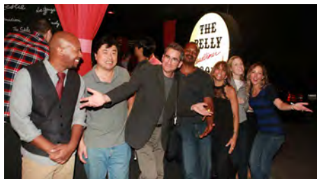
Stand-Up Comedy Workshop with Graduation Show

Hone your skills as a stand-up comic in an exciting hands-on workshop designed for both the absolute beginner as well as those already showcasing around town. The class culminates with a graduation show at the