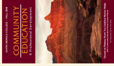
Fall 2018 Contest Winner

Non-Profit Organization U.S. Postage P A I D Santa Monica College