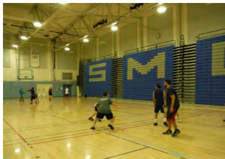
Basketball for the Rest of Us