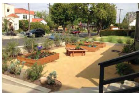
Basic Organic Gardening

Sun 2:00 p.m. – 4:00 p.m. Mar 3 – Mar 24