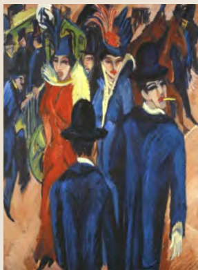
Kirchner Berlin Street Scene 1913 (Fall Signature Lecture)