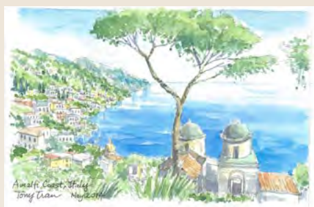
Amalfi Coast, Italy (Plein Air Outdoor Watercolor Painting)

QuickBooks I & II are conveniently scheduled on the same day, so you can make the most of your time. The newly added Business Planning Series will help the entrepreneur in you kickstart that business venture you've always dreamed about. Our VERY exclusive Alternative Dispute Resolution (ADR) Certification class has been expanded to five weeks, to give you more attention and practice. See pages 15–16 for more details.